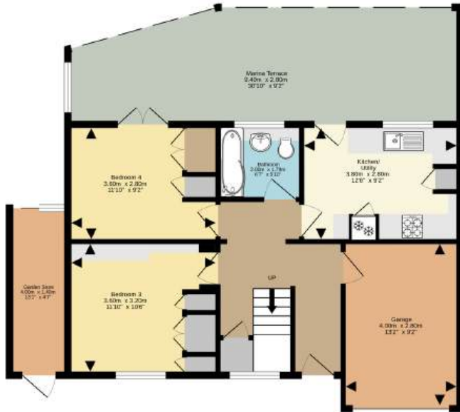
Ground Floor 88.6 sq.m. (954 sq.ft.) approx.