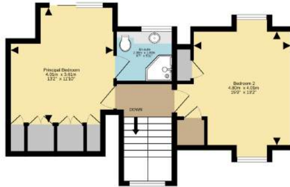
2nd Floor 42.8 sq.m. (461 sq.ft.) approx.